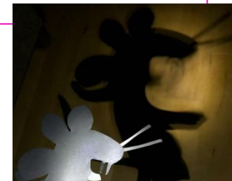
The Gruffalo's Child Shadow Puppets

Make and explore shadow puppets https://www.science-sparks.com/the-gruffalos-child-shadow-puppet/